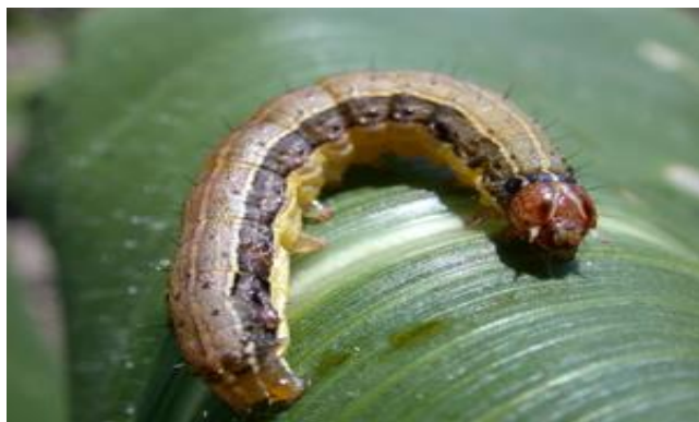
Photo 1 Fall Army Worm

Fall Army Worm (FAW) infestation is still in existence in Upper River Region (URR) and is also reported in West Coast Region (WCR) during this period ( photo 1 ). The Infestation at West Coast Region is not as serious as URR and no major damages is reported in either of the regions. This could be because of just the beginning of the rainy season.