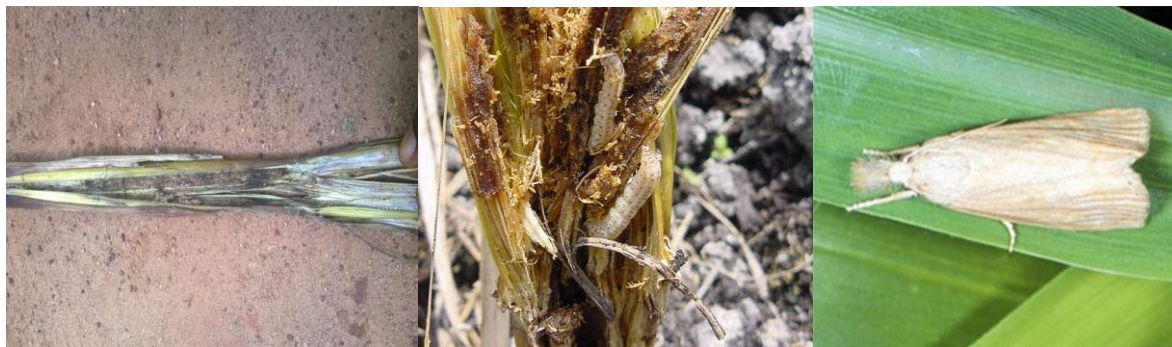
Left-right: damage stem, larvae feeding on tissues, and the adult moth

The stem borer ( Coniester ignefusalis ) is another important pest of the millet. The eggs are laid in clusters of 20-25 between the leaf sheaths and the stem. The eggs hatch into larvae which have dark spots on the body. The larvae are notorious for tunneling in the stem and feeding on the conducting tissues which support translocation of water and minerals within the plant. This feeding action leads to damage stems, dead heart and poor grain development.