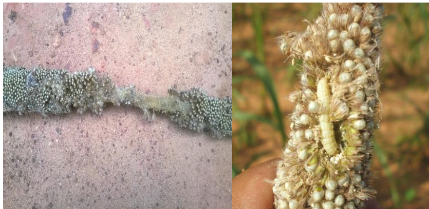
Symptoms of infested panicle

There is a range of pest that attack field crops at different stages. The millet head miner ( Heliocheilus albipunctella ) is one of the pests that affect millet fields at maturity mainly feeding on the grains. The adults lay eggs on the millet heads with preference to half grown and fully grown flowering heads. When the eggs hatch, the first larval instars feed on the flowers while the mature larvae mine the developing grains on the head leading to damage panicles. The larvae bore into the soil for pupation.